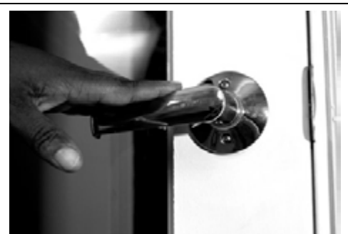
Figure 1: Lever handle for door